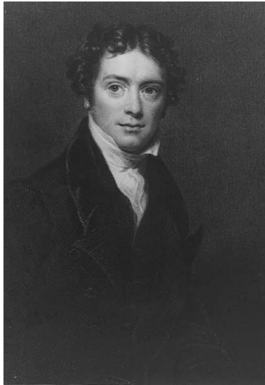
Fig. 5. Michael Faraday (1791–1867).

There is no evidence that these British writers on the matter-force relationship influenced Faraday (figure 5) directly, 44 yet there can be no doubt that they, and Priestley in particular, made natural philosophers in Britain especially receptive to the view that action is propagated by means of quasi-substantial physical “powers” capable of occupying space, though not in the way a traditionally-understood mechanical medium would. Whatever of this, it took years of intellectual struggle on Faraday’s part to resolve that his experimental findings on electrical induction could be understood best by supposing that induction works by means of forces that in some sense or other really fill the intervening spaces, leaving no gap in the transmission of action. 45 As already noted, he kept reminding his readers of the speculative character of this departure from ontological orthodoxy, that is, from the ontologically non-committal safety of the action-at-a-distance tradition. But as time went on, one can see him become more and more confident of the independent “physical existence,” his favorite phrase in this context, of lines of force. Though he