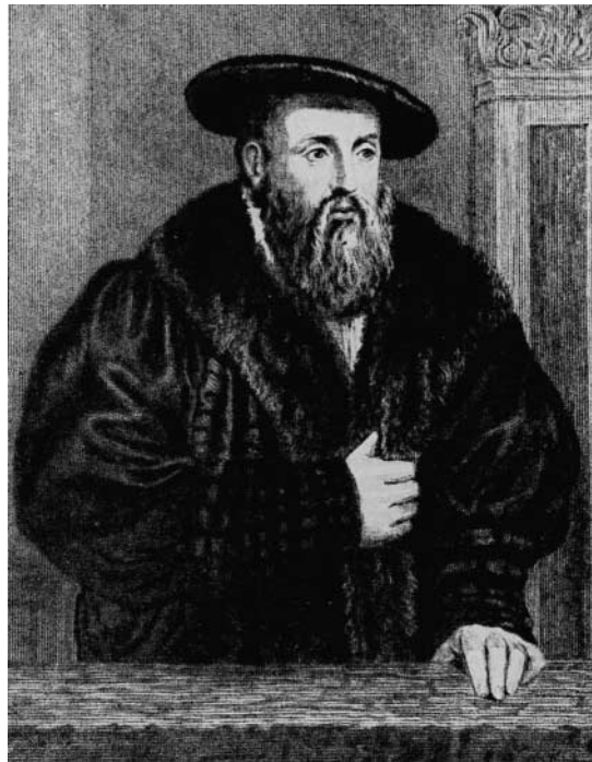
Fig. 1. Johannes Kepler (1571–1630).

In his Astronomia Nova (1609), Johannes Kepler (figure 1) offered a new and, as it turned out, highly significant addition to the list of phenomena for which attraction, in one form or another, seemed the only plausible explanation. Planetary