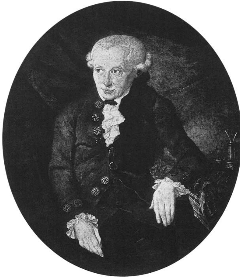
Fig. 4. Immanuel Kant (1723–1804). Lithograph from a painting by Gottlieb Doepler, 1781.

appropriate (though not necessarily the only) test of the physical reality of the fluid itself and hence of the theory’s qualifying as a field theory proper, would be the possession of properties other than the disposition specified by the field function itself.